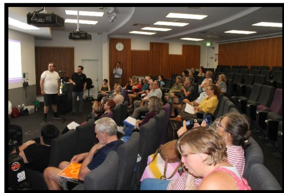
Afternoon entertainment by local band "The Outsiders".

Participants learning how the use of PATH assists with planning for independent living